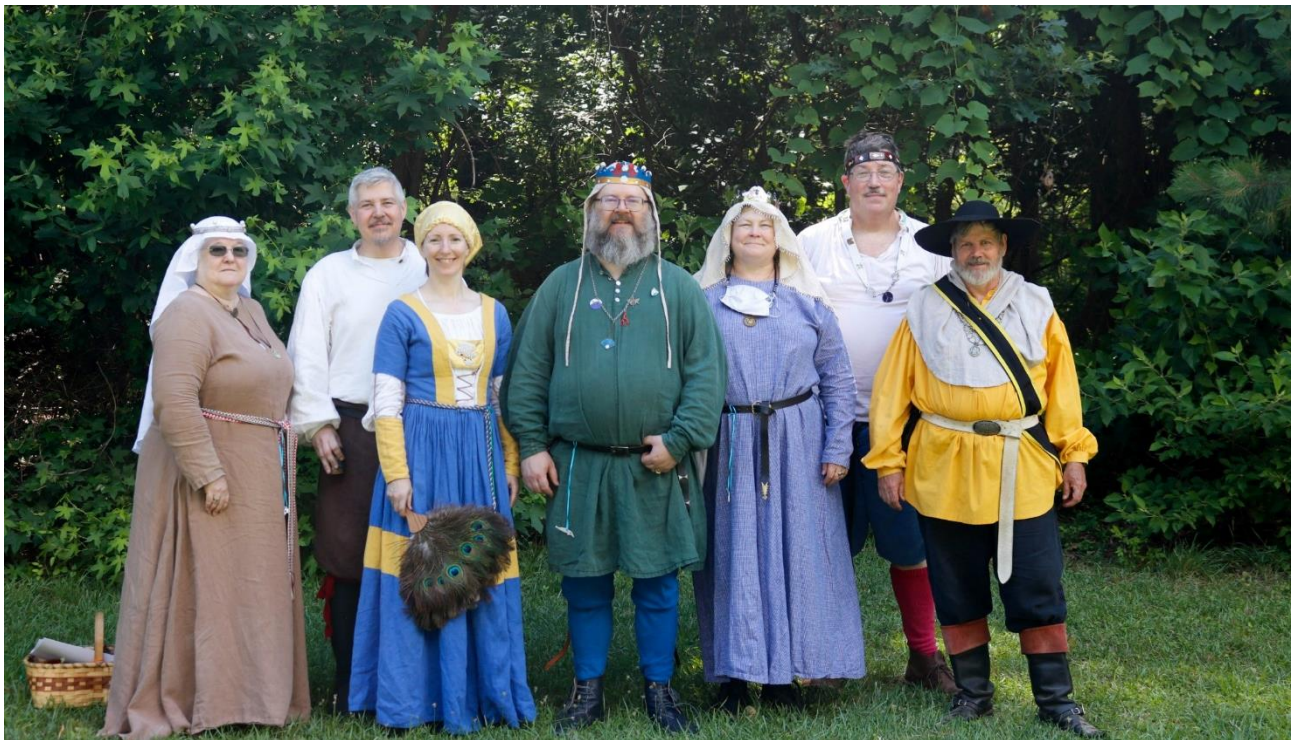
Current and past landed baronage at Baronial Birthday

Contact MOAS or Baroness Kaleeb for more details